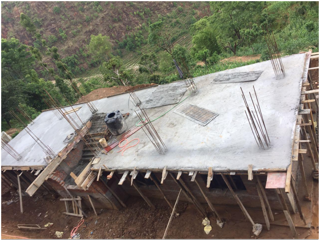
CONCRETING WORKS IN 1ST FLOOR